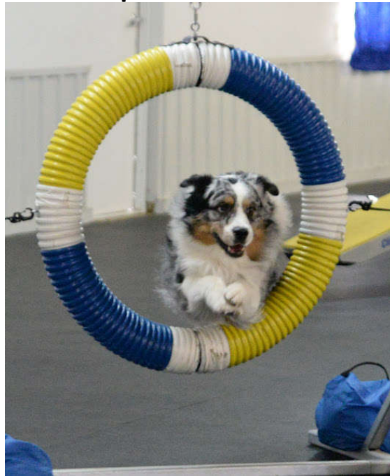
March 2023 Novice Agility Trial