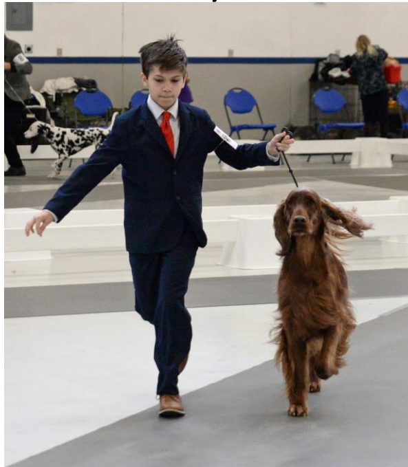
January 2024 Winter Show