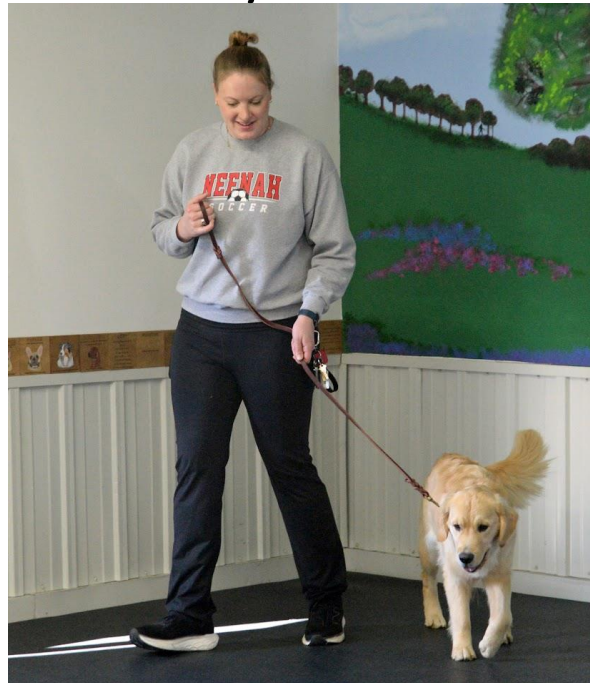
April 2024 Canine Good Citizen Testing