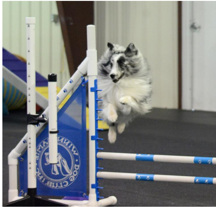
August 2024 Agility Trial