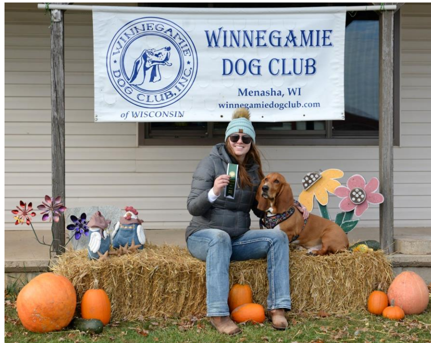
2024 Farm Dog Trial