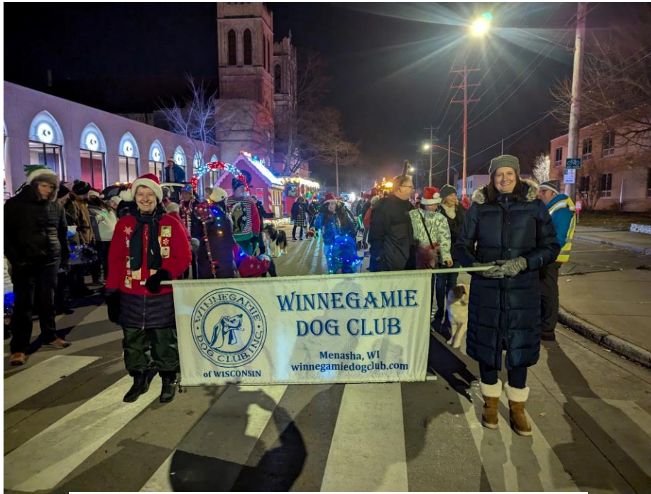
2024 Appleton Christmas Parade