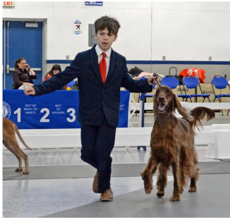
2025 Winter All Breed Show