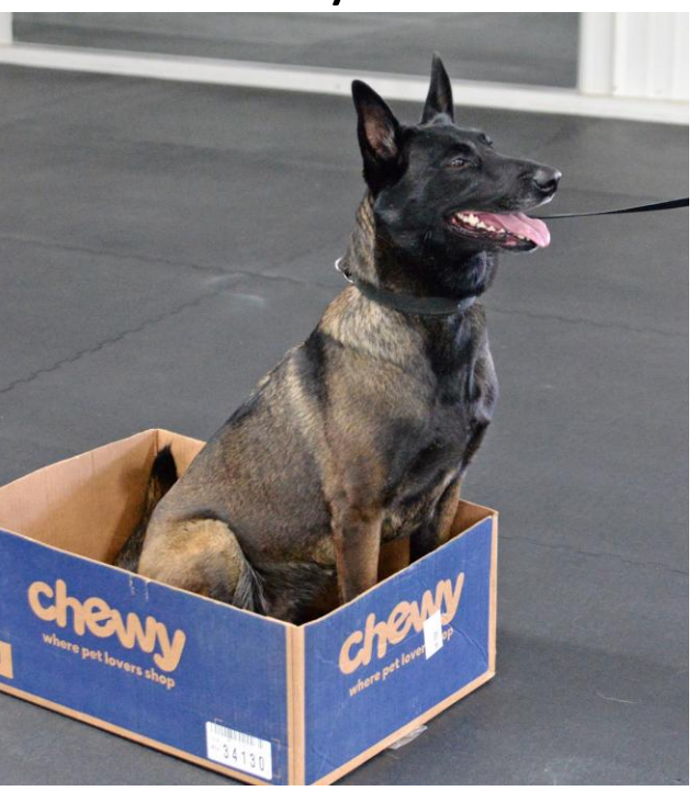
April 2025 CGC & Tricks